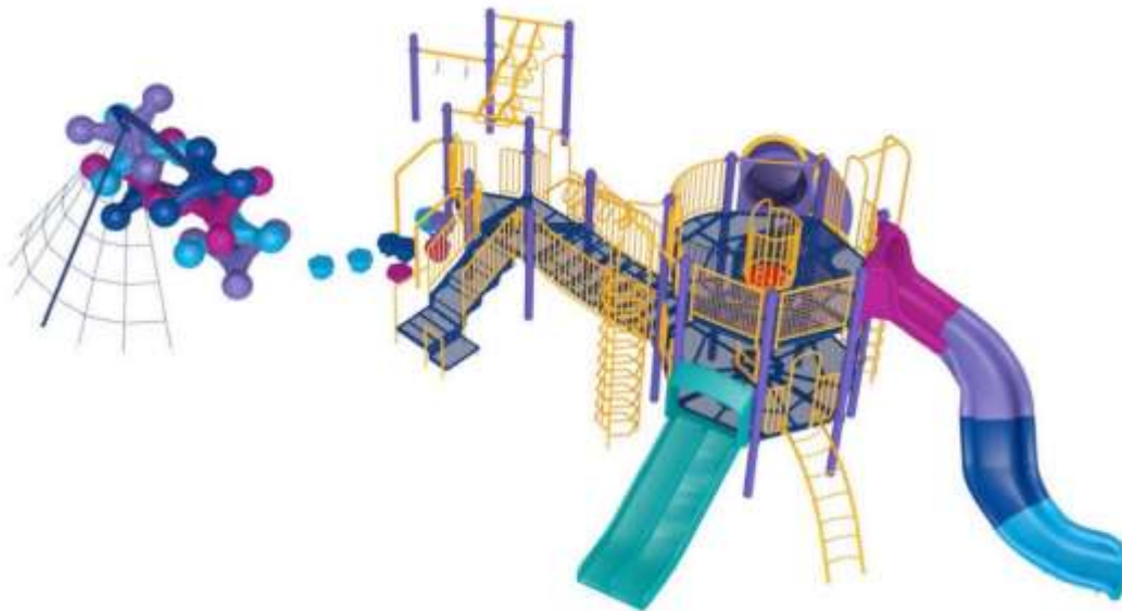
Proposed new Play Structure for ages 5-12