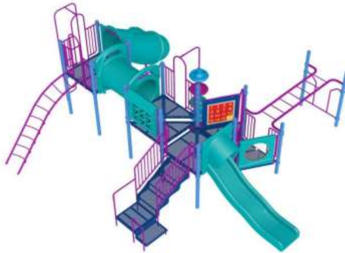
Proposed new Pre-K & Kindergarten Structure for ages 2-5

Fundraising has begun for new play structures on the school playground. Did you know our current play structures are 15-20 years old and are showing their age? Below are renderings of the possible new structures. We are still working out the details – let us know what you think! We would love to have more parent input and help! Please join us in the NES Library on Wednesday, March 16 th at 6:30pm.