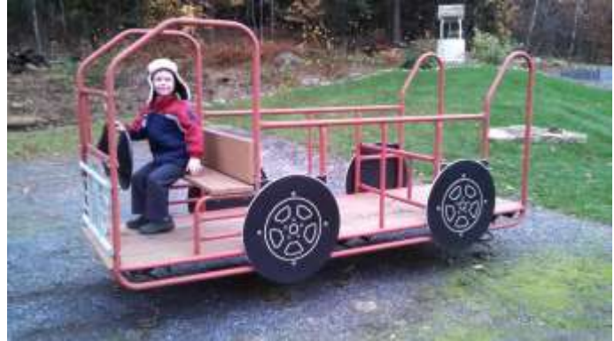
Fire Truck Rider