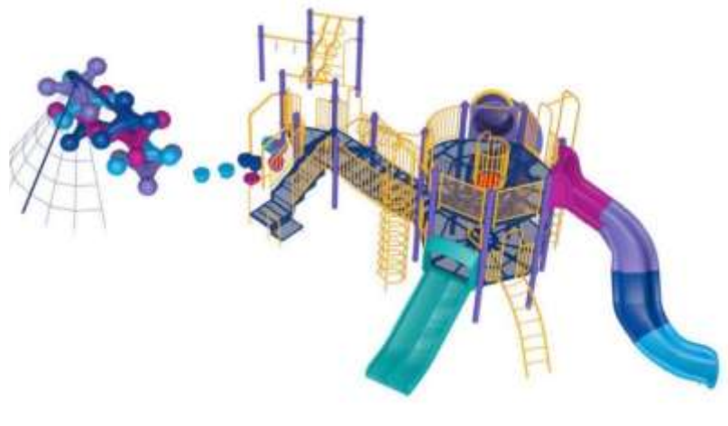
Proposed new Play Structure for ages 5-12

Contact us: northfieldelementarypto@gmail.com Visit our webpage: www.nespto.org Like our Facebook page: Northfield Elementary PTO