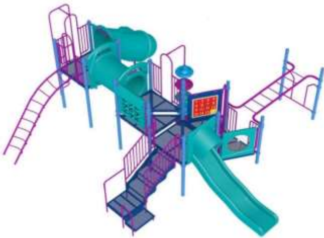
Proposed new Pre-K & K Structure for ages 2-5