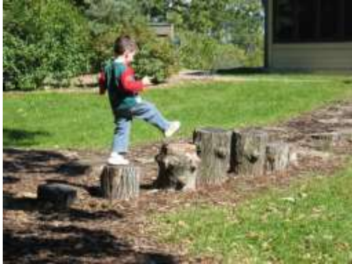
Example of a Stump Walk

The Playground Improvement Committee met on April 19 th , May 25 th , and May 31 st to continue work on several improvement plans for the NES Playground. We are working towards finalizing the plan to replace the current, outdated and not-to-code structures that are on the playground right now. Structures that need replacing are the Pre-K/K & Big Kid structures, the swingsets, and the zipline structures. The structure known as the "Spider" (the big climbing geodesic dome in the back) is still in good shape and up to code and will stay! Projects we would like to get done this summer include installing a refurbished Fire Truck rider for the Pre-K/K area and installing a Stump Walk. We are also researching what type of playground musical instrument to install next to expand the Music Garden area of the playground. Current members of the Playground Improvement Committee are: Cheryl George, Kelly Gagnon, Lara Dubin, Missy Kalinowski, Deb Potee, Joe Stacy, and Stacy Quinn. If you would like to join the Playground Improvement Committee, just send an email to northfieldelementarypto@gmail.com . It would be great to have more members!